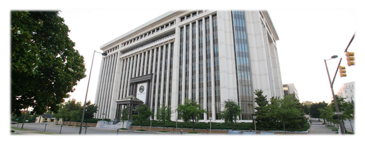
The Board Office has moved to Suite 880 in the RSA Union Building at 100 North Union Street in Montgomery.